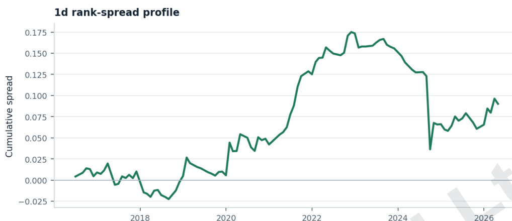
Figure 1. Cumulative 1d top-minus-bottom rank-spread contribution. Long-horizon forward observations overlap, so the series should be read as a ranking diagnostic, not as a standalone return path.