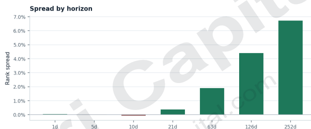
Figure 2. Top-minus-bottom spread across tested horizons using the same comparison setup.