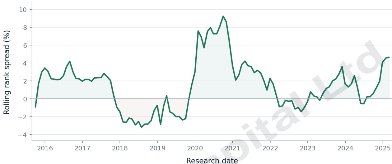
Figure 3. Rolling 63d top-minus-bottom rank spread. The line shows a smoothed research profile, not a live allocation path.

Horizon stability is the main robustness evidence in this note. The result should be read through the full profile, not only the headline horizon. The horizon profile is coherent rather than a one-point result.