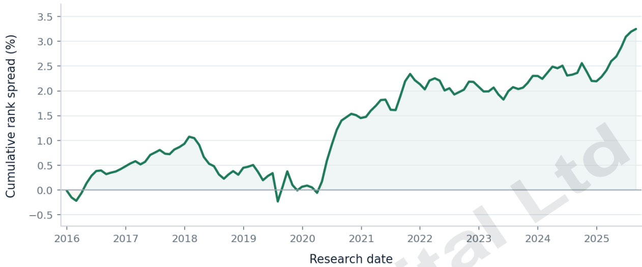
Figure 1. Cumulative 63d top-minus-bottom rank-spread contribution. Long-horizon forward observations overlap, so the series should be read as a ranking diagnostic, not as a standalone portfolio NAV.